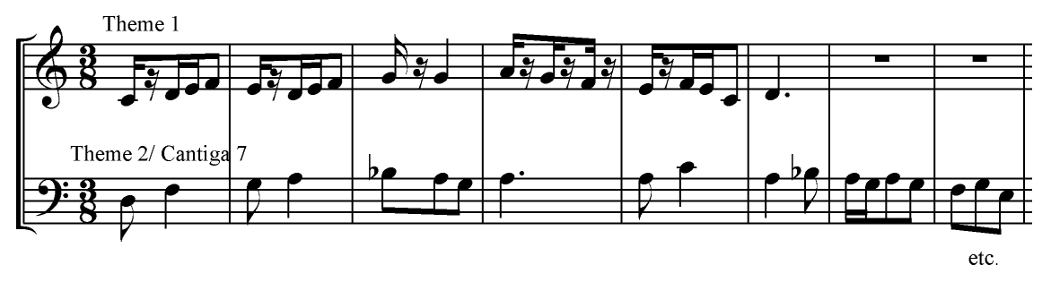
"Fight for Calahorra"

The tonal center of the cue shifts to A, a mediant relationship, and the theme is then repeated an octave higher with reversed instrumentation. The relationship of a third between themes in various cues happens so often in the film that it becomes a unifying characteristic. Moreover, Rózsa unusually shifts the key of some cues to a new one a third away, rather than the traditional modulation via fifths. The composer presumably had particular effects in mind by using so many mediant relationships in the score. The tonal center shifts again to D minor and a new theme is introduced in the low strings and brass, directly translating Cantiga 7, "Santa Maria Amar." The theme and the original cantiga are so similar that examples of both are not necessary to illustrate it. The theme itself is very long and takes nearly twenty bars to reach a cadence point.