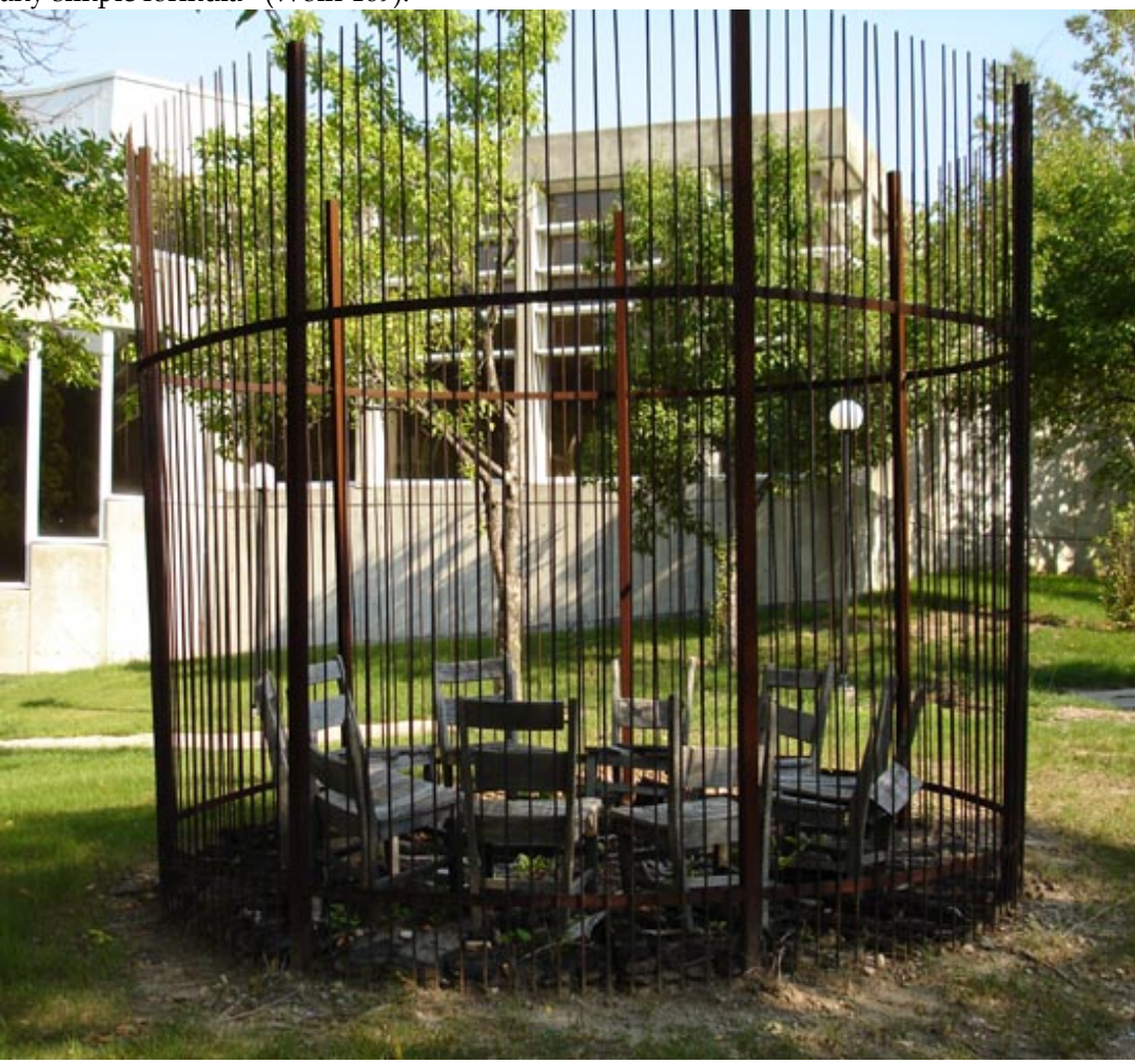
Figure 1 Cyril Reade, Minyan, 1995

Wolff, however, argues that beauty can actually support the mission of engagement. Referring again to the work of a literary critic, she echoes the possibility for a "complex beauty of 'presence'" that serves quite a different role from that previously mentioned: it is a beauty that "is not a consolation for the threat of death, but a mark of its presence in life" (qtd. in Wolff 167). Any risk of trivializing or glossing over atrocity by invoking beauty can be avoided with an appropriately complex aesthetic – allusive realism, semi-abstraction. Cyril Reade accomplishes this in his sculpture Minyan (Fig. 1), which "begins its appeal to the viewer through the beauty of its construction" but is "indirect and irreducible to any simple formula" (Wolff 169).