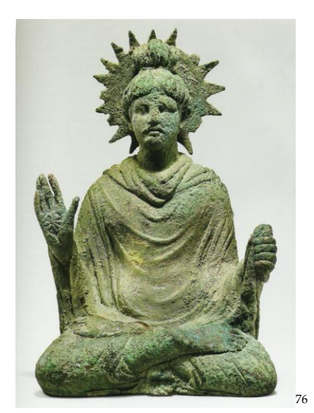
Figure 3. Bronze casting of the Buddha.

The first century CE also saw the development of devotional images of the Buddha, such as the seated Buddha shown below. This figure (Figure 3), only six inches high, represents one of the earliest devotional images of the Buddha known to exist. Although the subject matter is not Hellenistic, the artistic style is. His head is idealized and looks more like Hellenistic portraiture than anything known from Indian art. His earlobes are of normal proportions, and his garment is rendered in a natural manner with irregular folds. Even his hair, which is often curly in later artwork, is straight. Hellenistic that the Buddha has hair is surprising, since as a monk he should be portrayed with a tonsure. Instead, he is depicted as a weary, yet young man. This is not particularly surprising, as baldness was considered unattractive by Hellenistic artists, and in other artwork his hair resembles that of Hellenistic gods. The Buddha's halo, which was extensively used in Hellenistic artwork, may also signify Hellenistic influence.