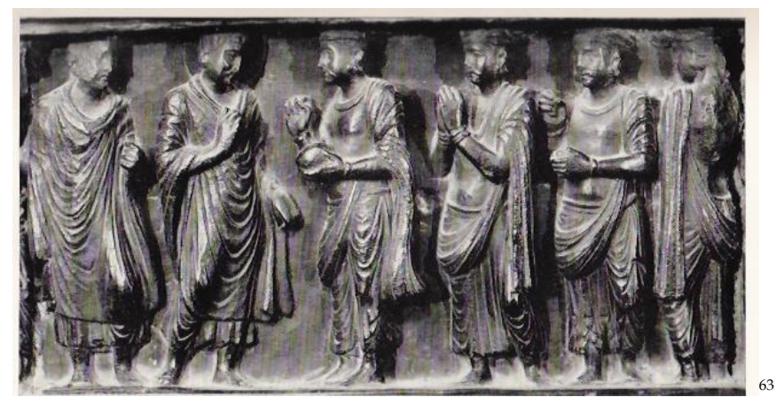
Figure 2. The donation of the Jevanta Garden.

Many scenes that include the Buddha mix elements of Greek and Indian culture as the following image illustrates. This scene is believed to depict the donation of the Jetavana Garden to the Buddha by a rich merchant, Ananthapindika (Figure 2).