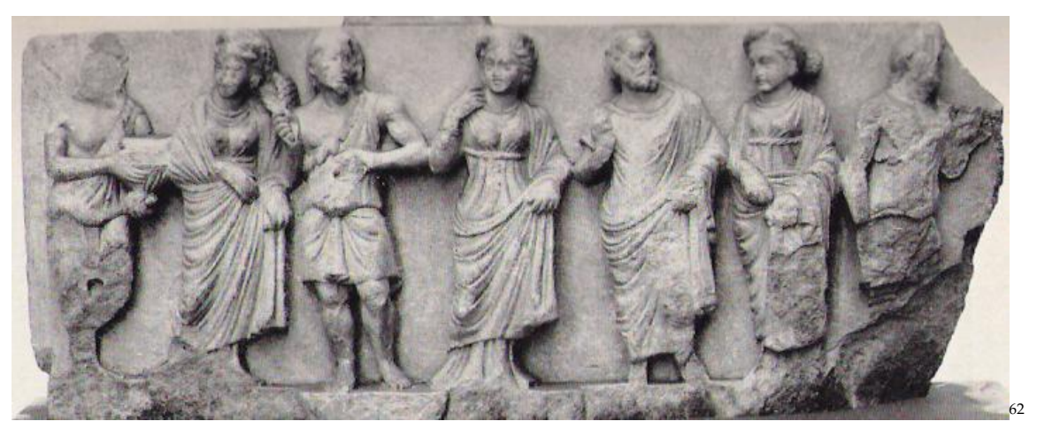
Figure 1. Side panel from a Gandharan stupa.

Many scenes that include the Buddha mix elements of Greek and Indian culture as the following image illustrates. This scene is believed to depict the donation of the Jetavana Garden to the Buddha by a rich merchant, Ananthapindika (Figure 2).