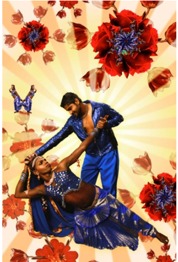
Figure 1. Southern Siren – Maheshwari by Tejal Shah, taken in 2006 as part of the What Are You? series.